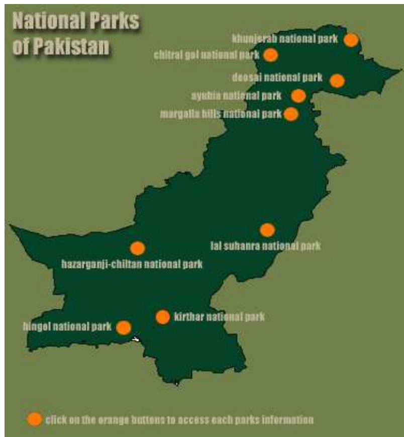
Figure 1. National Park System of Pakistan.