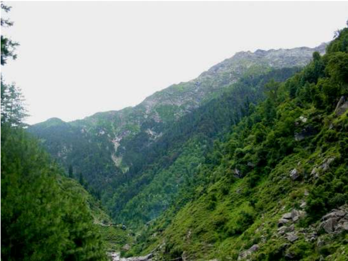
Figure 3. Panoramic View of Ayubia National Park Pakistan.