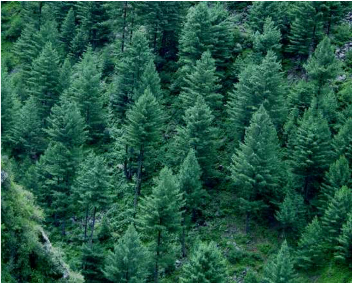
Figure 4. Blue Pine forest in Ayubia National Park.